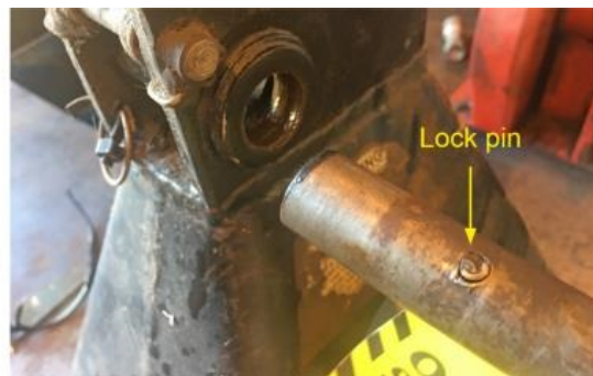
Left. Configuration of a ratchet vehicle support stand. Right. Sheared lock pin located in the locking handle.